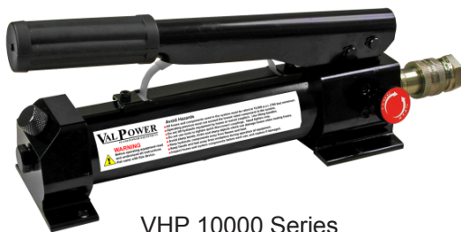
VHP 10000 Series ValPower® Series Hand Pump