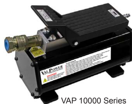
VAP 10000 Series ValPower® Series Pneumatic Pump